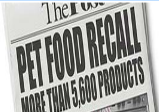
Buyer beware when purchasing pet products.

So then what do you do? I like to save money ;) I buy raw bones at the grocery store, round soup bones often labeled as dogs bones. The down side to this is the potential for chipping a tooth if you have an aggressive chewer, or a dog with dental surgery procedures already notched on